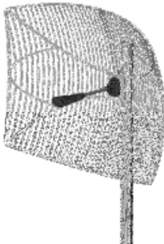
Figure 2: Illustration of Grid Dish to mast